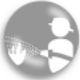
Fire and Rescue Safety